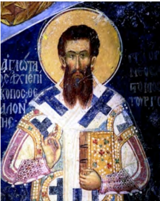
Figure 5. Gregory Palamas , c. 1371, fresco, eastern wall of the nave, Monastery of Vatopedi, Mt Athos (Greece)