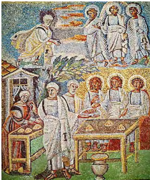
Figure 53. The Hospitality of Abraham , c. 432–440, mosaic, sanctuary, Church of Santa Maria Maggiore, Rome (Italy)