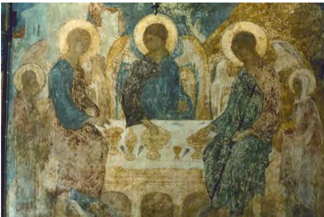
Figure 59. The Trinity, c. 1508, fresco, western wall of the gallery, painter Theodosius, Annunciation Cathedral, Kremlin, Moscow (Russia)