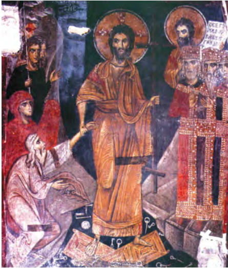
Figure 38. The Anastasis , c. 1259, fresco, sanctuary niche, Boyana Church of St Nicholas and St Panteleimon, Sofia (Bulgaria)