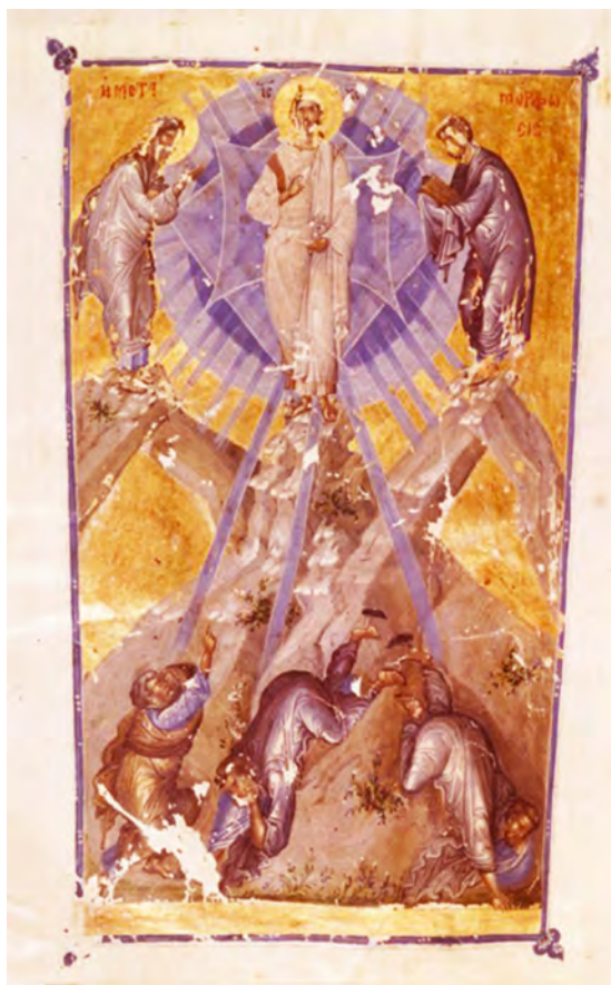
Figure 11. The Transfiguration of Christ , c. 1375, book illumination, scribe Ioasaph, in J. Kantacuzenos, Disputatio cum Paulo Patriarcha Latino , Bibliothèque Nationale de France, ( Parisinus Graecus 1242), fol. 92V