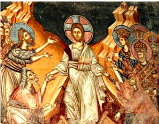
Figure 41. The Anastasis , 14th century, fresco, north wall of the naos, Monastery of Marko, Markova Sušica, Skopje (Macedonia)