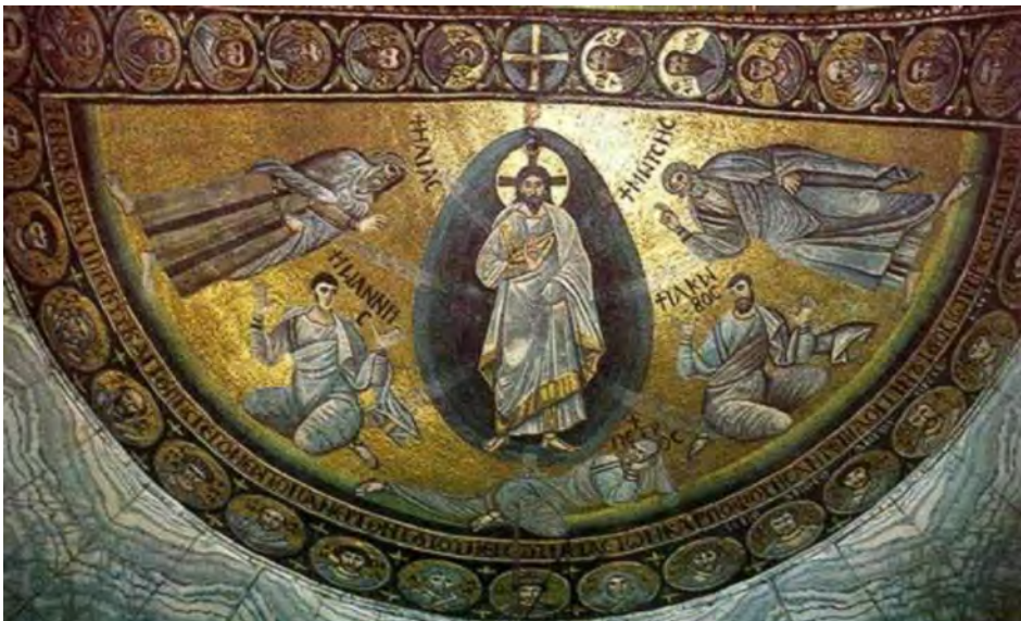
Figure 13. The Transfiguration of Christ , c. 565, mosaic, apse, Church of the Virgin, Monastery of St Katherine, Mt Sinai (Egypt)