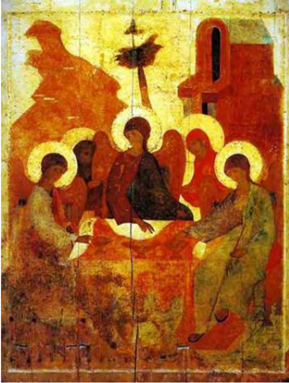
Figure 56. The Trinity, 15th century, tempera on wood, 161 x 122 cm, Trinity Sergius's Lavra, Sergius's Posad State History and Art Museum–Reserve, Moscow (Russia), inv. no. 2966