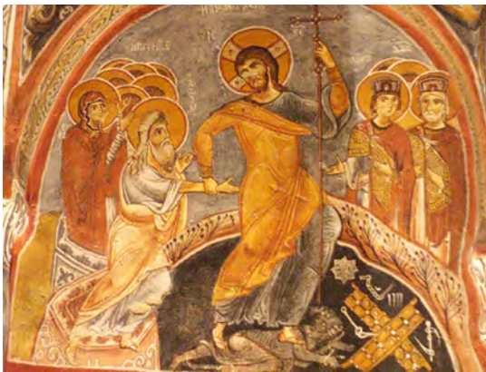
Figure 31. The Anastasis , c. 1060s – 1070s, fresco, right wall of the smaller apse, Karanlık Killise, Göreme (Cappadocia)

Adding diverse and unexpected features to the fully evolved Palaeologan style, the Anastasis at Chora shows the contrast between the humanistic and the theocentric view of God and man, which became apparent during the hesychast controversy. It also expresses the hesychast concept of theosis , the union of grace (by adoption) between human beings and Christ. It is as though, through the supernatural grace of God, the painter of the Anastasis had transcended his creatureliness, his human intellect, and had become transcendent even to his own self-knowledge. The symbolism of light within this fresco is crucial as it enhances the illusionist, immaterial feel of the image. The fresco is illuminated by the mystical light of God.