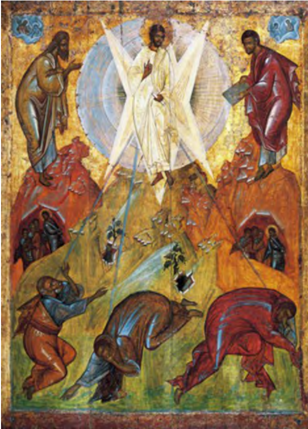
Figure 27. The Transfiguration of Christ , c. 1403, tempera on wood, 184 x 134 cm, painter Theophanes the Greek, Tretyakov Gallery, Moscow (Russia), inv. no. 12797