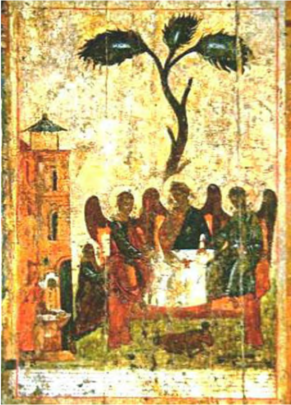
Figure 54. The Zyrian Trinity, 14th century, tempera on wood, 119 x 75 cm, painter Stephan of Perm, Vologda State Historical and Architectural Museum, Vologda (Russia), inv. no. 2780/6466Д