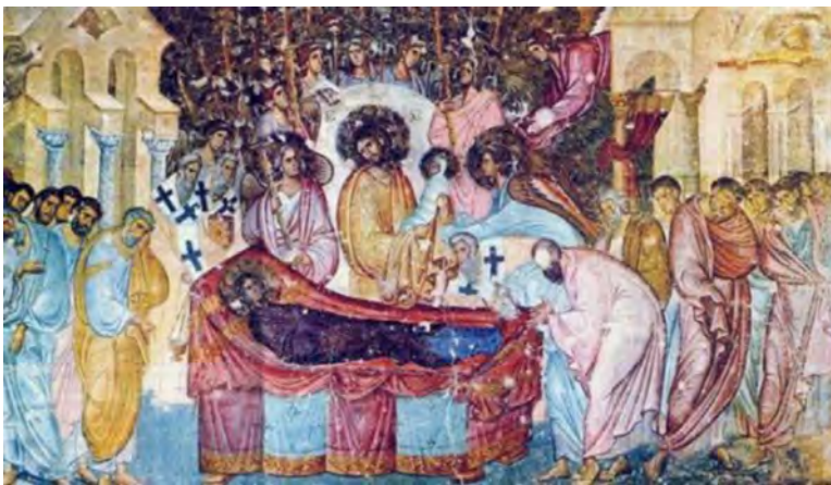
Figure 3. The Dormition of the Virgin , c. 1265, fresco, west wall of the nave, Monastery of Sopočani, Raška (Serbia)