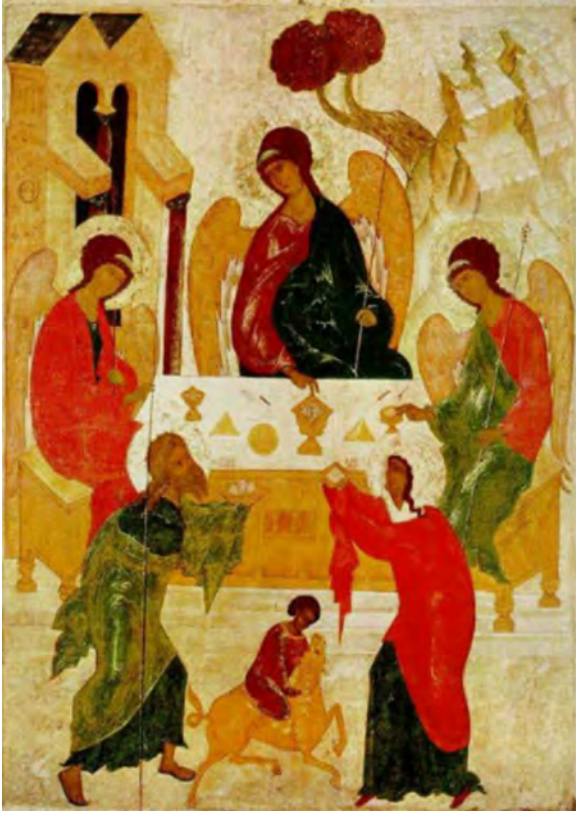
Figure 58. The Trinity, 15th century, tempera on canvas, 23.5 x 17.3 cm, Museum of History of Moscow, Novgorod (Russia), inv. no. 93096