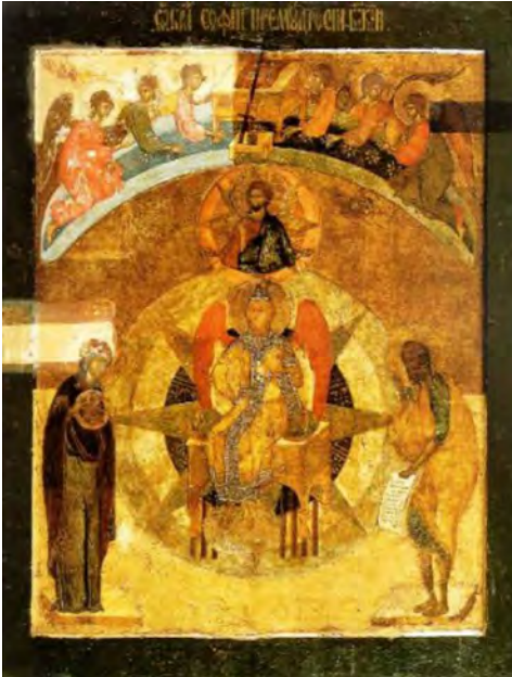
Figure 8. The Wisdom of God (Sophia) , mid-15th century, tempera on wood, 69 x 54.5 cm, Church of the Annunciation, Kremlin, Moscow (Russia), inv. no. 480 со6