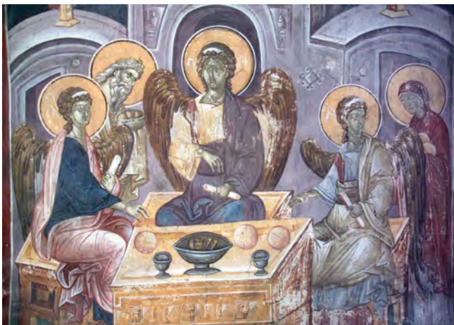
Figure 69. The Trinity, 14th century, fresco, east wall of the sanctuary, Monastery of Gračanica, Gračanica (Kosovo)