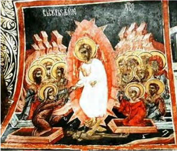
Figure 40. The Anastasis , 17th century, fresco, west wall, Church of Theodore Tyro and Theodore Stratelates, Dobarsko, Razlosko (Bulgaria)