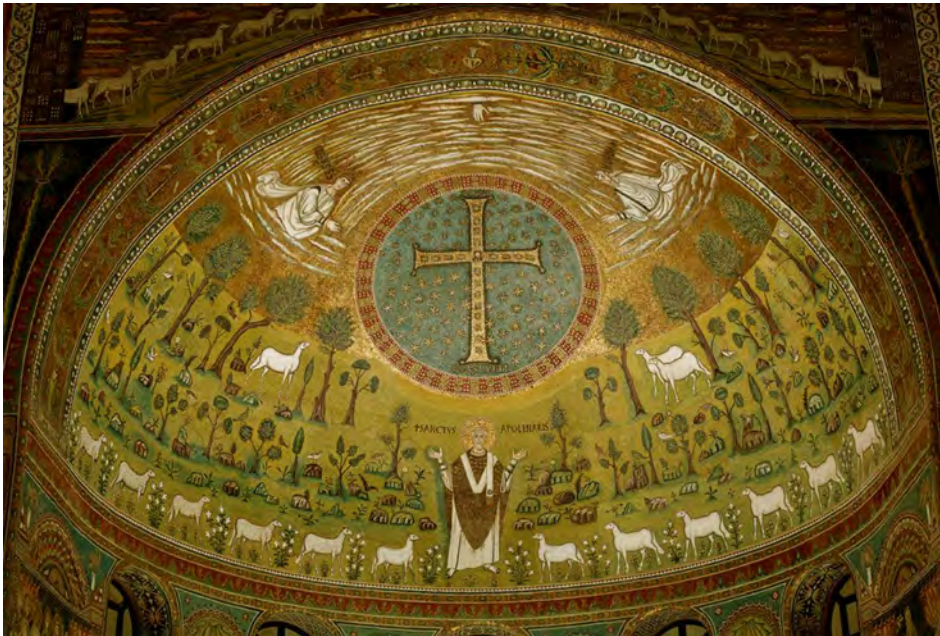
Figure 12. Saint Apollinaire amid Sheep , c. 549, mosaic, apse, Basilica of St Apollinaire in Classe, Ravenna (Italy)