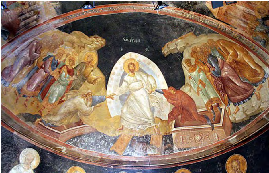
Figure 30. The Anastasis, c. 1315–1321, fresco, apse of the parekklesion, Church of the Saviour, Chora, Istanbul (Turkey)

Enclosed by a luminous oval mandorla decorated with stars, the dominant and glorious figure of the risen Christ, clad in a white luminous chiton (a draped garment held on the shoulders by a brooch) and himation vanquishes Satan and breaks down the gates of hell. With a vigorous motion, Christ grasps Adam by the wrist with his left hand, and Eve with his right. He seems to lift Adam with only a slight flexing of his arm, in contrast to the strength he uses to lift Eve out of her tomb. On the right hand of Christ (from the viewer's left side) are two groups of the righteous; each led by a single figure detached from the rest of his companions. John the Baptist stands behind Adam in his capacity as