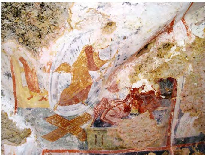
Figure 36. The Anastasis , 14th century, fresco, vaulted ceiling, Church of Archangel Michael, Rock-hewn churches of Ivanovo, Rusenski Lom (Bulgaria)