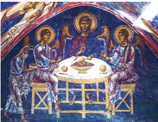
Figure 63. The Trinity, c. 1176–1180, fresco, left wall of the nave, Chapel of the Virgin Mary, Monastery of St John the Theologian, Patmos (Greece)