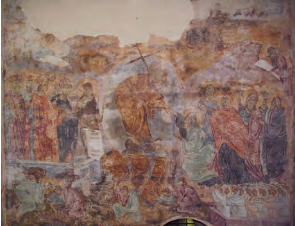
Figure 42. The Anastasis , 14th century, fresco, north wall of the nave, Monastery of Sopočani, Raška (Serbia)