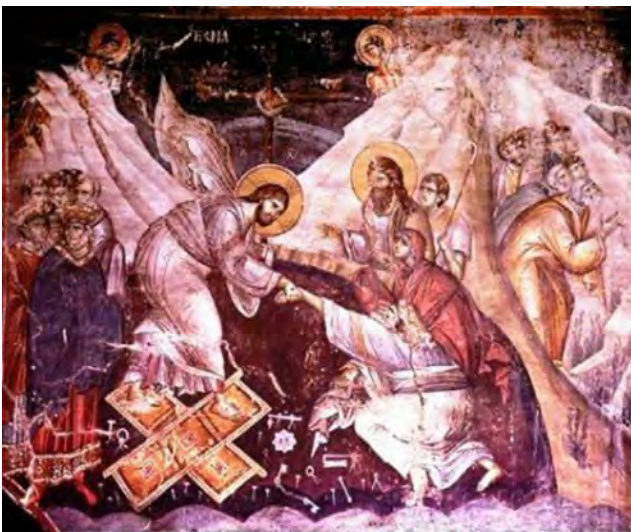
Figure 33. The Anastasis , 14th century, fresco, northern wall of the nave, Church of the Protaton, Karyes (Greece)