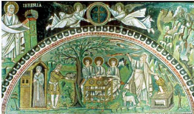
Figure 52. The Hospitality of Abraham , c. 532–547, mosaic, nave, Church of San Vitale, Ravenna (Italy)