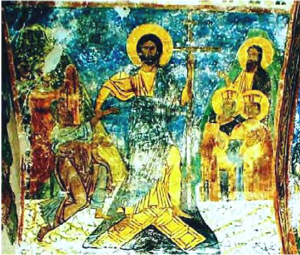
Figure 46. The Anastasis , c. 1130–1140, fresco, north vault of the narthex, Cathedral of the Transfiguration, Mirozhsky Monastery, Pskov (Russia)