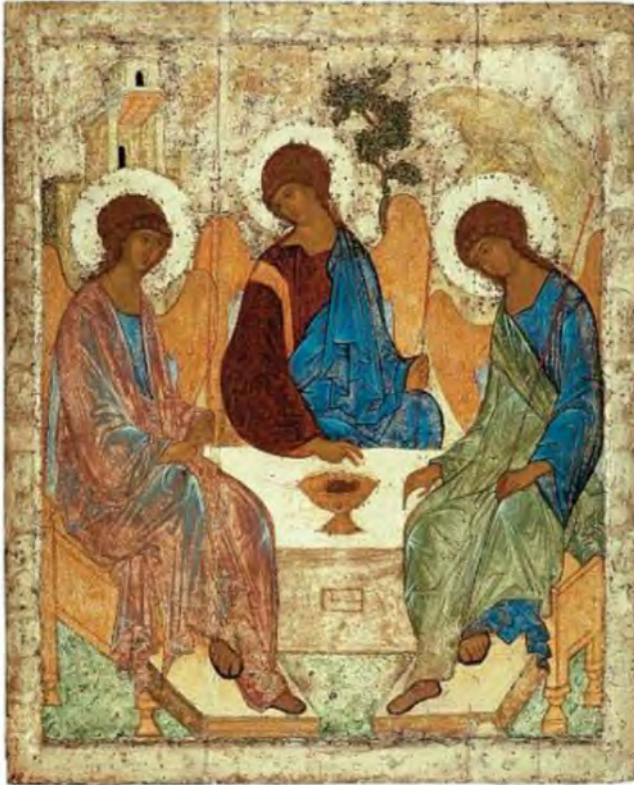
Figure 51. The Trinity , 15th century, tempera on wood, 142 x 114 cm, painter Andrei Rublev, Tretyakov Gallery, Moscow (Russia), inv. no. 12924