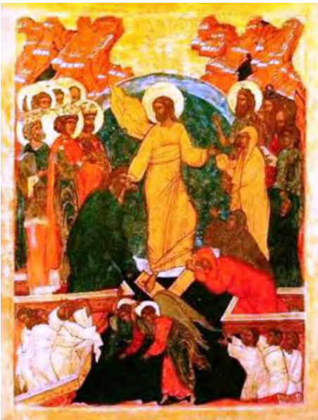
Figure 49. The Anastasis , first half of the 16th century, tempera on wood, 76 x 55 cm, Pskov State United Historical, Architectural and Fine Arts Museum-Reserve, Pskov (Russia), inv. no. 1616