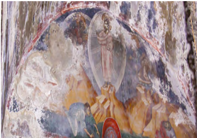
Figure 23. The Transfiguration of Christ , 14th century, fresco, narthex, Church of St Archangel Gabriel, Monastery of Lesnovo, Probistip (Macedonia)