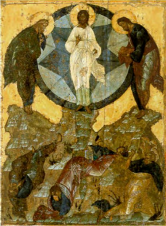
Figure 29. The Transfiguration of Christ , 15th century, tempera on wood, temple icon, Church of Our Savior in the Woods, Kremlin, Moscow (Russia)