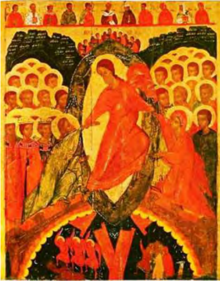
Figure 48. The Anastasis , 15th–16th century, tempera on wood, 20 x 99 cm, Pskov State United Historical, Architectural and Fine Arts Museum-Reserve, Pskov (Russia), inv. no. 2731