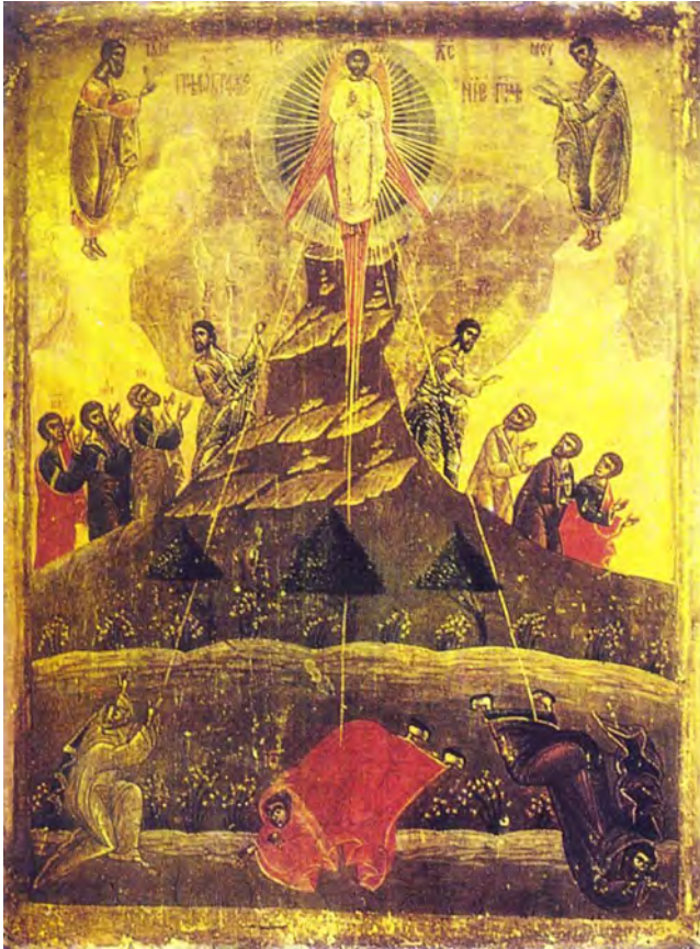
Figure 19. The Transfiguration of Christ , 13th century, tempera on wood, Monastery of Xenophon, Mt Athos (Greece)