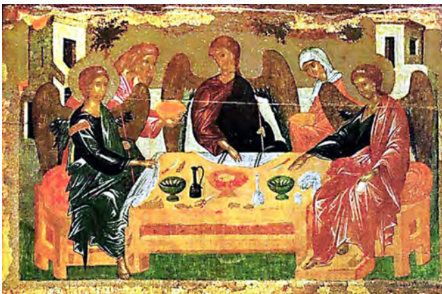
Figure 61. The Trinity, late-14th – early 15th century, tempera on wood, 36 x 54.2 cm, State Hermitage Museum, St Petersburg (Russia), inv. no. I-1/Лих.II-165 (1806)