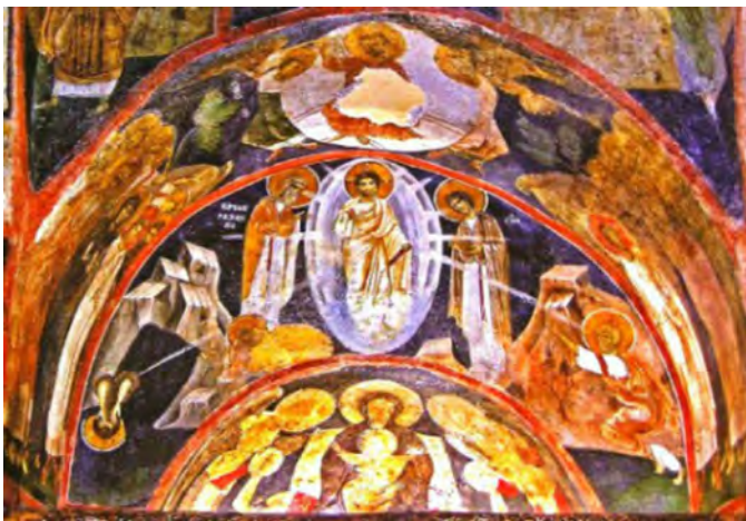
Figure 25. The Transfiguration of Christ , c. 1259, fresco, sanctuary, Boyana Church of St Nicholas and St Panteleimon, Sofia (Bulgaria)