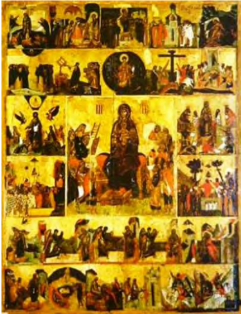
Figure 10. The Akathistos Hymn , 14th century, tempera on wood, 198 x 153 cm, Cathedral of the Dormition, Kremlin, Moscow (Russia)