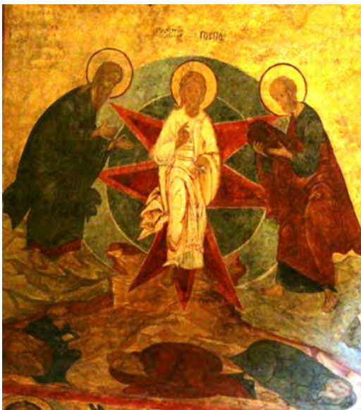
Figure 16. Transfiguration of Christ , 17th century, fresco, vault of the nave, right side, painters Sidor Pospheyev, Ivan Borisov and Semyon Abramov, Church of the Deposition of the Robe, Kremlin, Moscow (Russia)