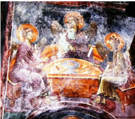
Figure 67. The Trinity, early 14th century, fresco, left part of the narthex, Church of St Nikita, Banjani (Macedonia)