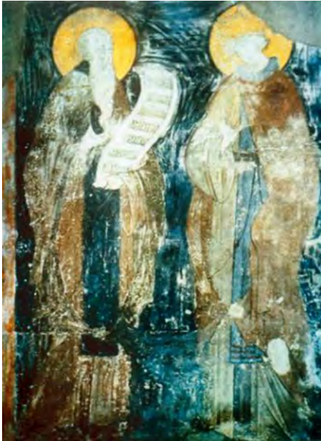
Figure 6. Barlaam and Iosaphat , c. 1400, fresco, painter Andrei Rublev, Church of the Dormition of the Virgin Mary, Gorodok, Zvenigorod (Russia)