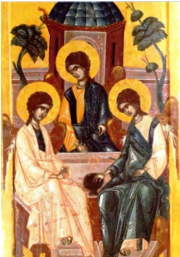
Figure 71. The Trinity, 16th century, tempera on wood, 101 x 61 cm, attached to the iconostasis, Monastery of Dečani