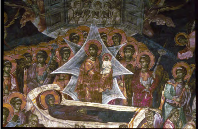
Figure 4. The Dormition of Virgin , c. 1321, fresco, west wall of the nave, Monastery of Gračanica (Serbia)