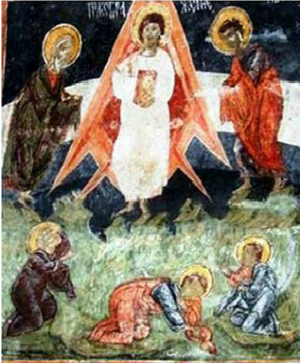
Figure 26. The Transfiguration of Christ , 17th century, fresco, northern wall of the nave, Church of Theodore Tyro and Theodore Stratelates, Dobarsko, Razlosko (Bulgaria)