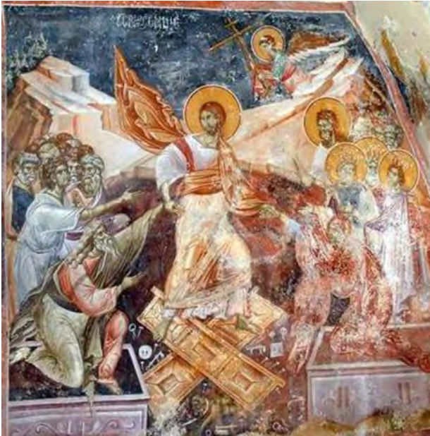
Figure 44. The Anastasis , 14th century, fresco, west wall of the nave, King Milutin's Church, Monastery of Studenica, Studenica, (Serbia)