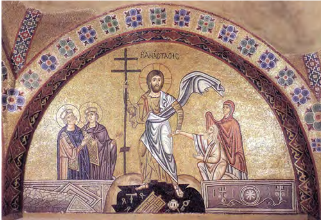
Figure 34. The Anastasis , first half of the 11th century, mosaic, narthex, Church of Hosios Loukas, Phocis (Greece)