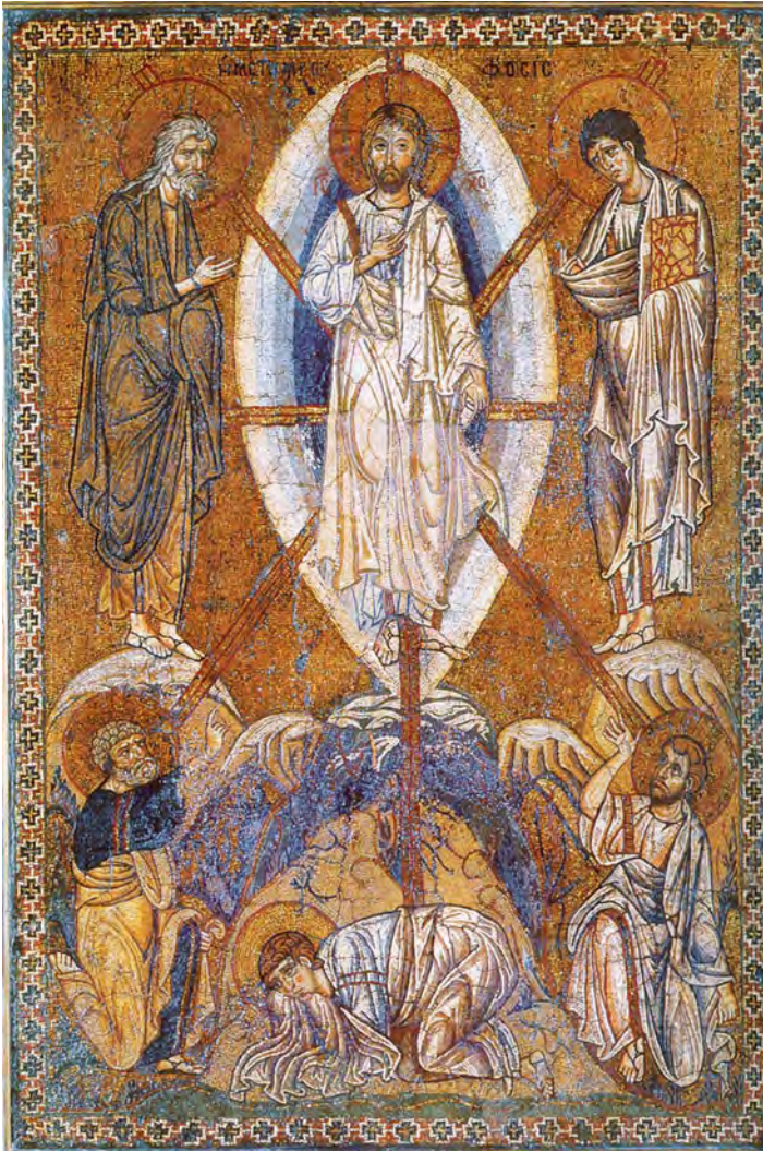
Figure 14. The Transfiguration of Christ , first half of the 12th century, tempera on wood, 52 × 35.3 cm, Musee du Louvre (France), inv. no. ML 145, 6591