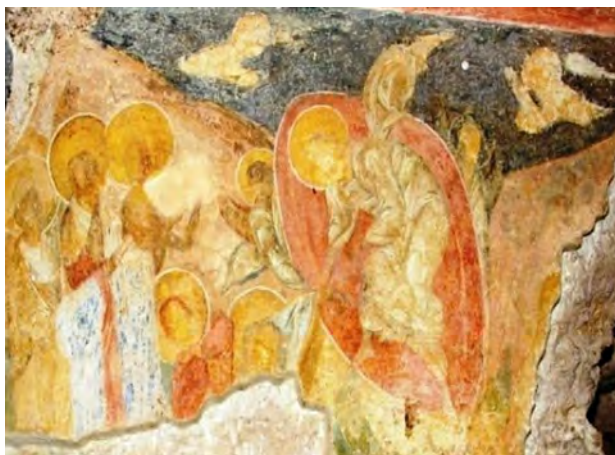
Figure 37. The Anastasis , 14th century, fresco, vaulted ceiling of the nave, Church of the Virgin Mary, Rock-hewn churches of Ivanovo, Rusenski Lom (Bulgaria)