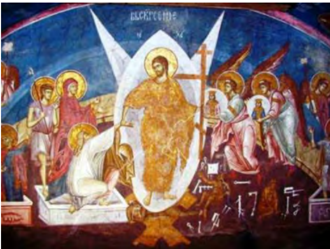
Figure 45. The Anastasis , 14th century, fresco, east wall of the narthex, Monastery of Dečani, Dečani, (Kosovo)