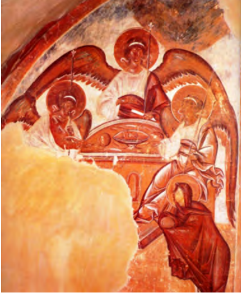
Figure 64. The Trinity, c. 1378, fresco, eastern wall of the western vestry, painter Theophanes the Greek, Church of the Transfiguration, Novgorod (Russia)