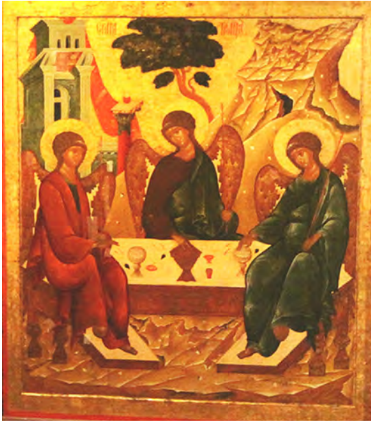
Figure 60. The Trinity, 15th century, tempera on wood, in front of the iconostasis (soleas), lower tier, painter Sidor Osipov or Ivan Borisov, Church of the Deposition of the Robe, Kremlin, Moscow (Russia)