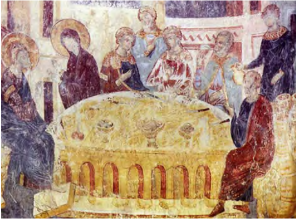
Figure 70. The Wedding at Cana, 15th century, fresco, southern apse, painter Radoslav, Monastery of Kalenić (Serbia)