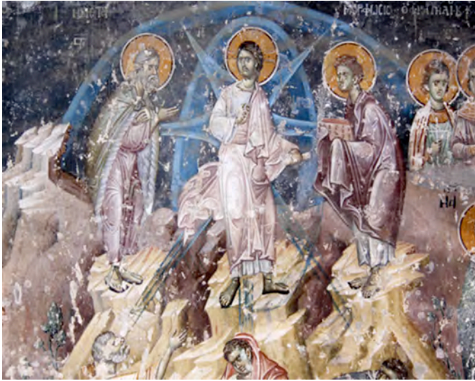
Figure 22. The Transfiguration of Christ , c. 1313–1320, fresco, west wall, painters Eutykhios and Michael Astrapas, Church of St George, Staro Nagoricane, Skopje (Macedonia)