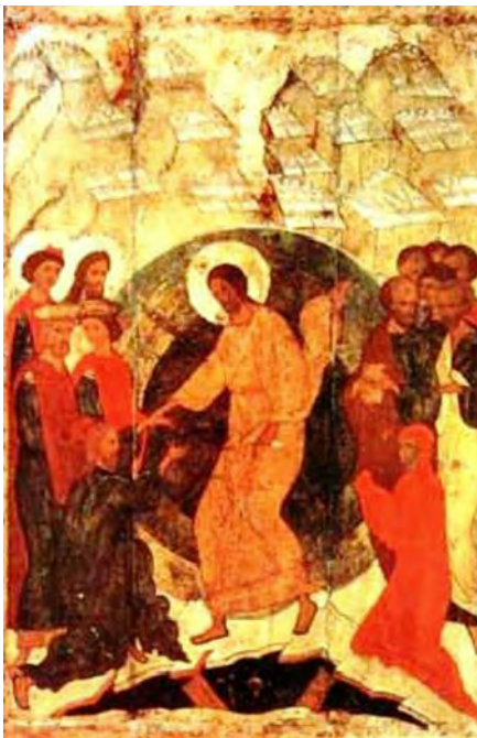
Figure 47. The Anastasis , late-15th century, tempera on wood, 91 x 63 cm, Tretyakov Gallery, Moscow (Russia), inv. no. 14316