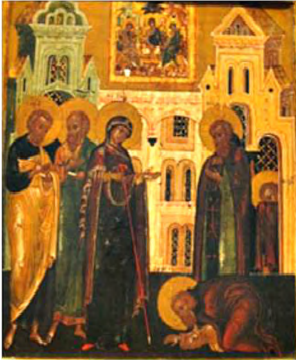
Figure 55. The Apparition of the Virgin to Sergius of Radonezh, late-16th century, tempera on wood, 30 x 25 cm, Trinity Lavra of St Sergius, Novgorod (Russia), currently at Murray Warner Collection of Oriental Art, University of Oregon (USA), inv. no. MWRU 34/15