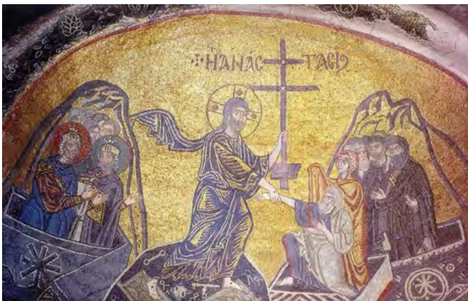
Figure 35. The Anastasis , mid-11th century, mosaic, naos, north apse, Church of Nea Moni, Chios (Greece)