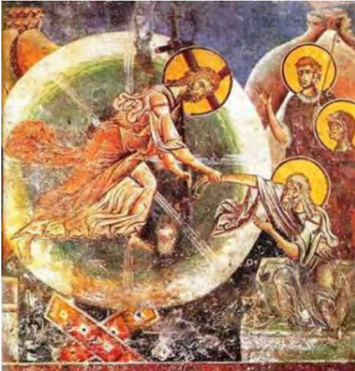
Figure 32. The Anastasis , c. 1191, fresco, western wall of the nave, Church of St George, Kurbinovo (Macedonia)