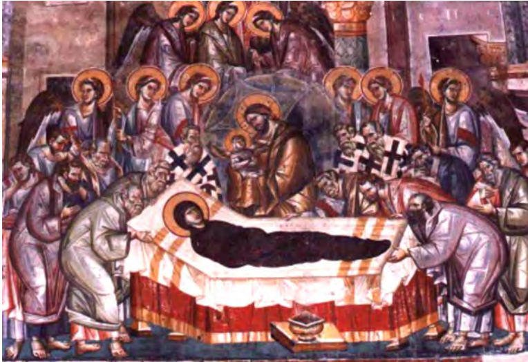
Figure 2. The Dormition of the Virgin , c. 1294–1295, fresco, west wall of the nave, painters Eutybios and Michael Astrapas, Church of St Clement Ohridski (Church of the Virgin Peribleptos), Ohrid (Macedonia)