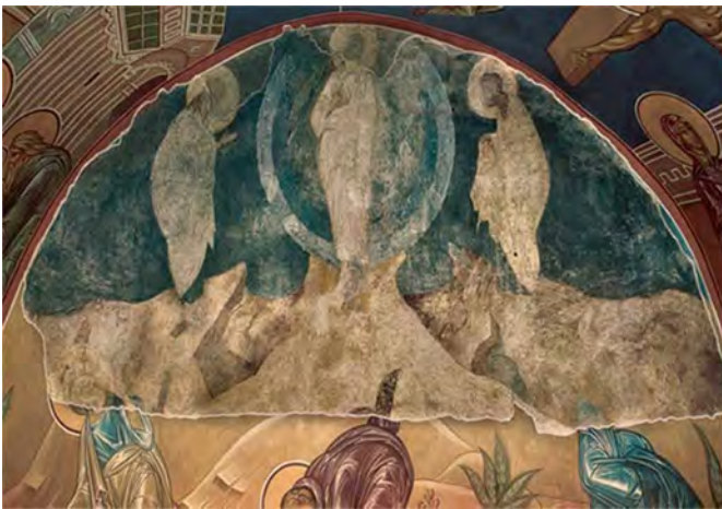
Figure 21. The Transfiguration of Christ , c. 1408, fresco, lunette walls in the northern arm of the cross, Dormition Cathedral of the Virgin, Vladimir (Russia)