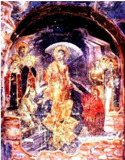
Figure 43. The Anastasis , 14th century, fresco, painter Georgios Kalliergis, Church of the Resurrection of Christ, Veroia (Greece)