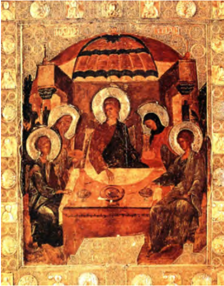
Figure 62. The Trinity, late-14th century, tempera on wood, 117 x 92 cm, Monastery of Vatopedi, Mt Athos (Greece), exclusive photograph of O.G. Uliyanov, Head of Department of Church Archaeology, Andrei Rublev Museum of Early Russian Culture and Art, Moscow (Russia), 2005