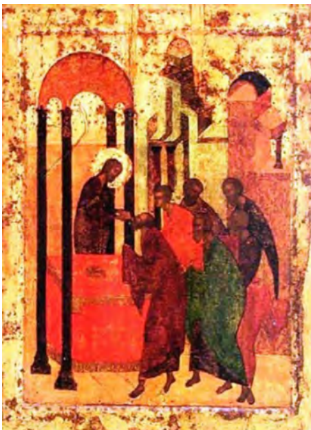
Figure 7. The Communion of the Apostles , c. 1425–1427, tempera on wood, 87.5 x 67 cm, Cathedral of the Trinity, Trinity-Sergius's Lavra, Sergiev Posad (Russia), inv. no. 3050