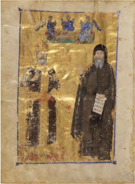
Figure 66. The Double Portrait of Emperor John Kantacuzenos, c. 1375, book illumination, scribe Ioasaph, in J. Kantacuzenos, Disputatio cum Paulo Patriarcha Latino , Bibliothèque nationale de France, (Parisinus Graecus 1242), fol. 5V