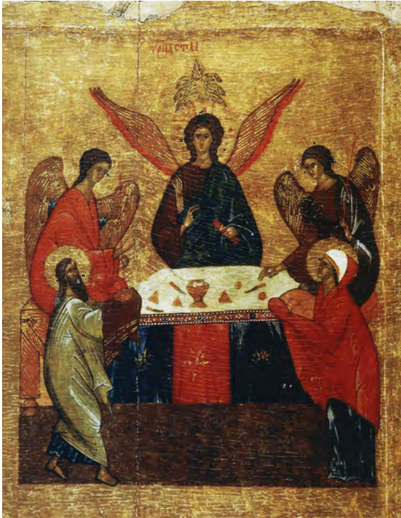
Figure 68. The Trinity, late-15th – early 16th century, tempera on wood, 23.5 × 17.3 cm, Museum of History and Architecture, Novgorod (Russia), cat. no. 35367