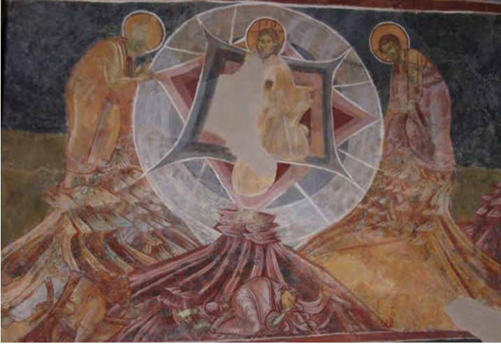
Figure 17. The Transfiguration of Christ , 12th century, fresco, northern wall of the nave, Church of St George, Kurbinovo (Macedonia)