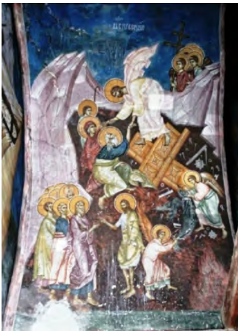
Figure 39. The Anastasis , 14th century, fresco, south wall, Church of the Virgin Hodegetria, Peć (Serbia)