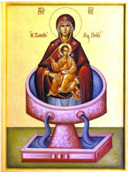
Figure 9. The Theotokos of the Life-giving Spring , c. 2012, tempera on wood, 69 x 54.5 cm, painter Anita Strezova, private collection (Sydney)