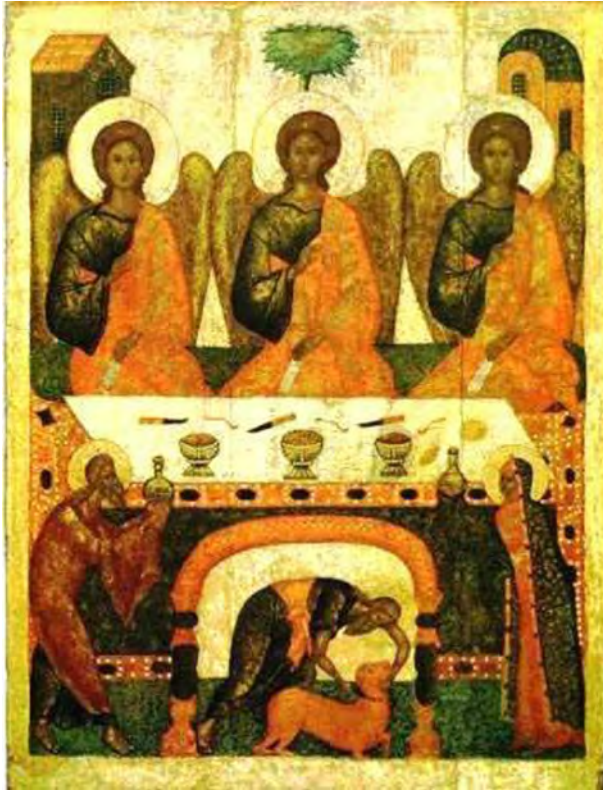
Figure 57. The Trinity, late-15th – early 16th century, tempera on wood, 145 x 108 cm, Pskov School, Tretyakov Gallery, Moscow (Russia), inv. no. 28597