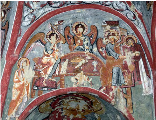
Figure 65. The Trinity, c. 1060s–1070s, fresco, western wall of the narthex, Church of Karanlik Killise, Göreme, Cappadocia (Turkey)