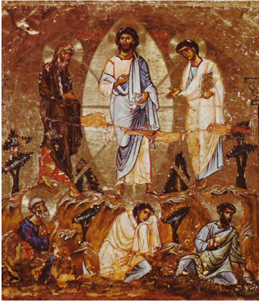
Figure 15. The Transfiguration , mid-12th century, tempera on wood, 41.5 x 159 cm, part of the iconostasis, Monastery of St Katherine, Sinai (Egypt)