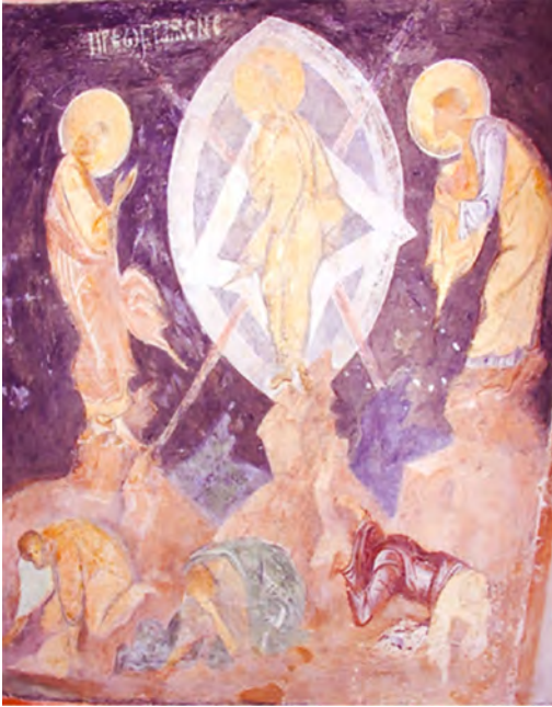
Figure 24. The Transfiguration of Christ , 14th century, fresco, vaulted ceiling, Church of the Virgin Mary, Rock-hewn churches of Ivanovo, Rusenski Lom (Bulgaria)