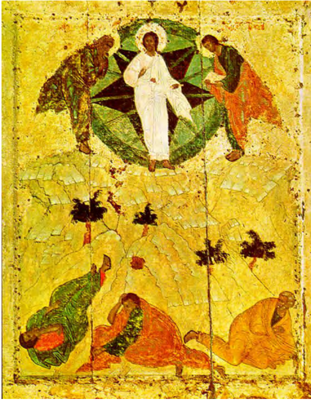
Figure 28. The Transfiguration of Christ , 15th century, tempera on wood 80.5 x 61 cm, painter Andrei Rublev, Church of the Annunciation, Kremlin, Moscow (Russia), inv. no. 3248 СОБ/Ж-1401