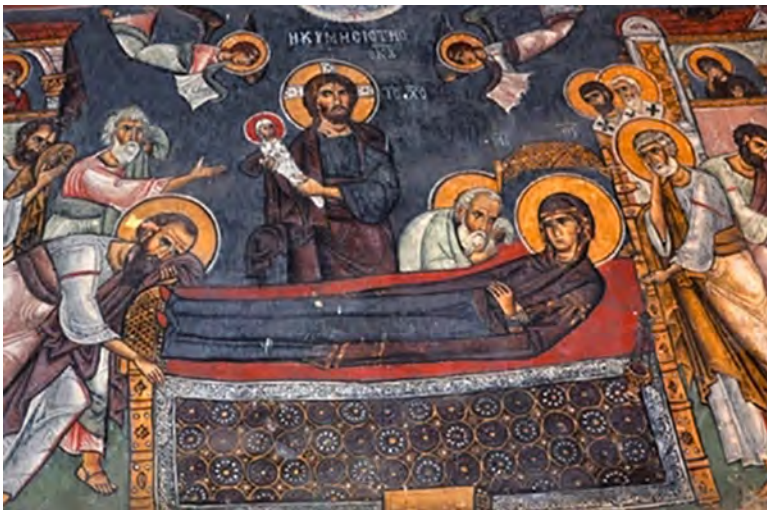
Figure 1. The Dormition of the Virgin , c. 1105–1106, fresco, west door of the nave, Church of Panagia Phorbiotissa, Asinou (Cyprus)

patterns on murals, consisting of red and blue bands within a circular band, fanlike highlights on figures, and the use of monochrome colours (red, ochre and dark shades of blue). The painted surfaces were illuminated with white strokes (on the face, neck and hands) representing the rays of the divine light. Given the widespread changes in style and iconography arising in the 14th and 15th centuries, it can be affirmed that iconographic trends during Paleologan era were shaped by mystical spiritual currents, one of them being the Byzantine hesychasm. Detailed analysis of three compositions of the Transfiguration, the Anastasis and the Trinity will provide evidence for this assertion.