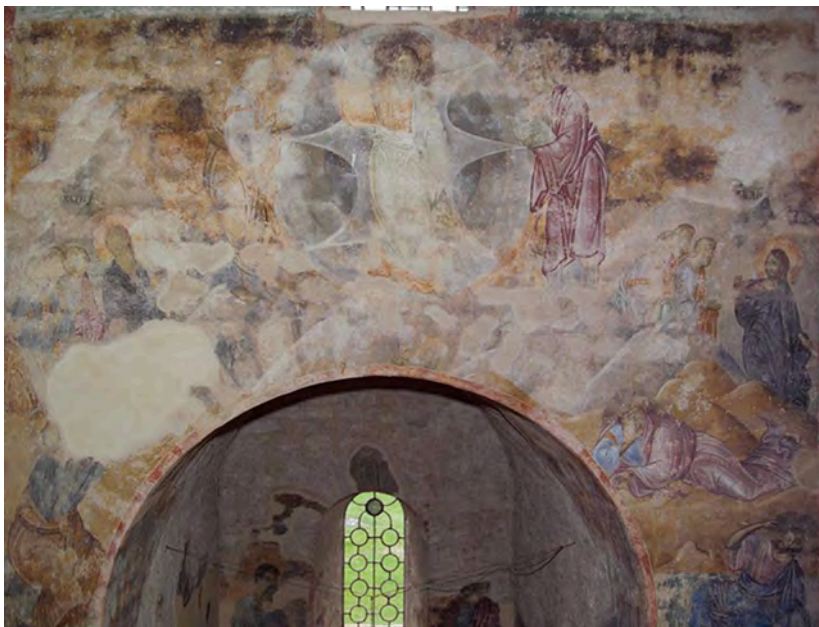
Figure 18. The Transfiguration of Christ , 14th century, fresco, central zone of the nave, Monastery of Sopočani, Raška (Serbia)